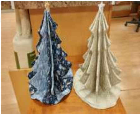
Table Top Xmas Tree Tannenbaum: This tabletop Tannenbaum is perfect for someone in a retirement/personal care home. The Tree measures 13" tall and the tree skirt is 12". It is quick and easy to sew and to store after the holidays! Just 6 fat quarters and Bosal Moldable heat active batting create this beautiful tree! This is a TWO Week class if necessary. The Batting will be available at the store. Please register early so we can have enough batting in stock. When: Tuesdays, December 4th and 11th @10:30am to 1:30pm. Cost: $15 + supplies. Teacher: Pauline Shushnar

Chevron Runner: This runner is a quick assemble using strips and squares in the dimensions of your choice. The sample was made from seven different holiday prints Joan found in her stash. Strips are applied in a chevron pattern building out from a center block in two directions. The project is constructed using the quilt-as-you-go technique, so once the strips and squares are sewn in place, you are ready to trim the sides and attach the binding. There is a very light batting inside. The runner can also be made by piec-